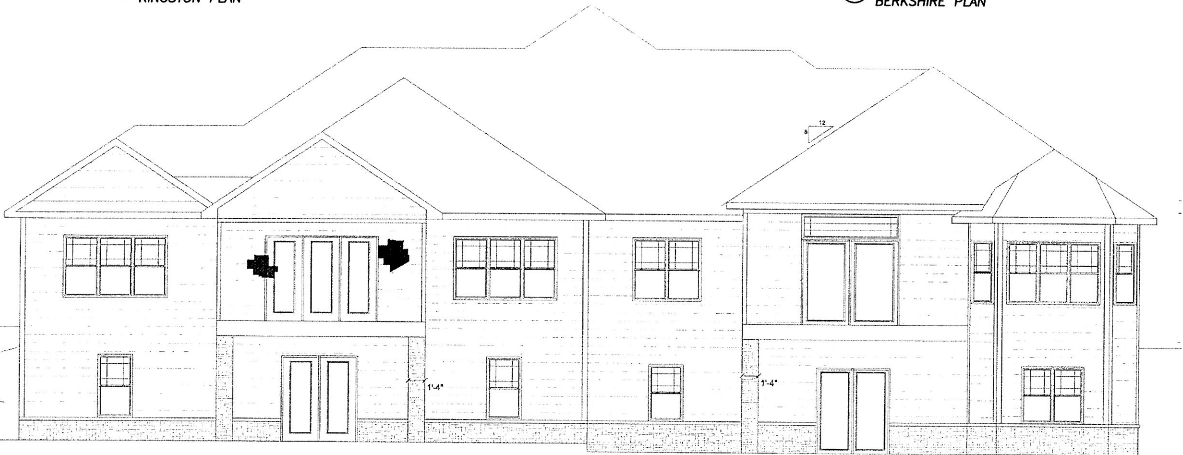
BUILDING 4, UNIT 7 BERKSHIRE PLAN