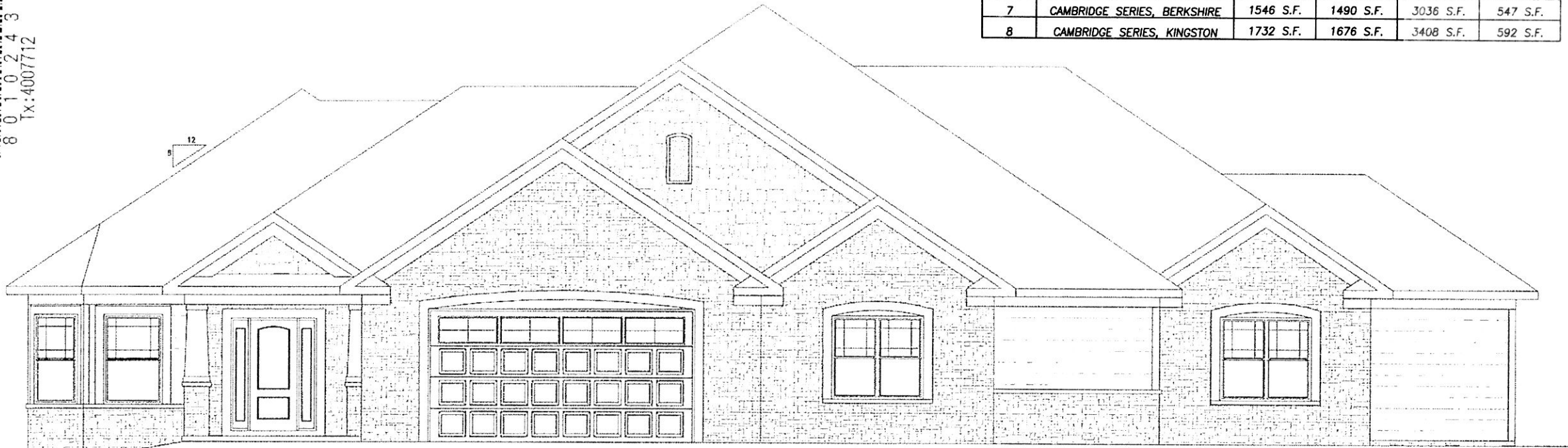
BUILDING 4, UNIT 8 KINGSTON PLAN