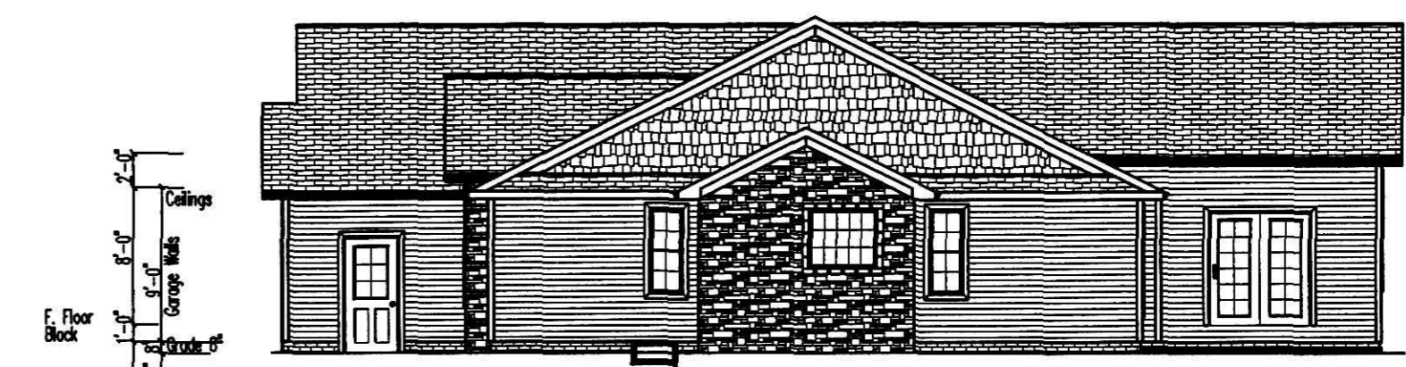
RIGHT ELEVATION LEFT ELEVATION SAME (REVERSED)

Instrument 20100065735 OR Book Page 19 1008 20100065735 KITCHFIELD... & JOHNSTON ATTYS MILLERSBURG OH