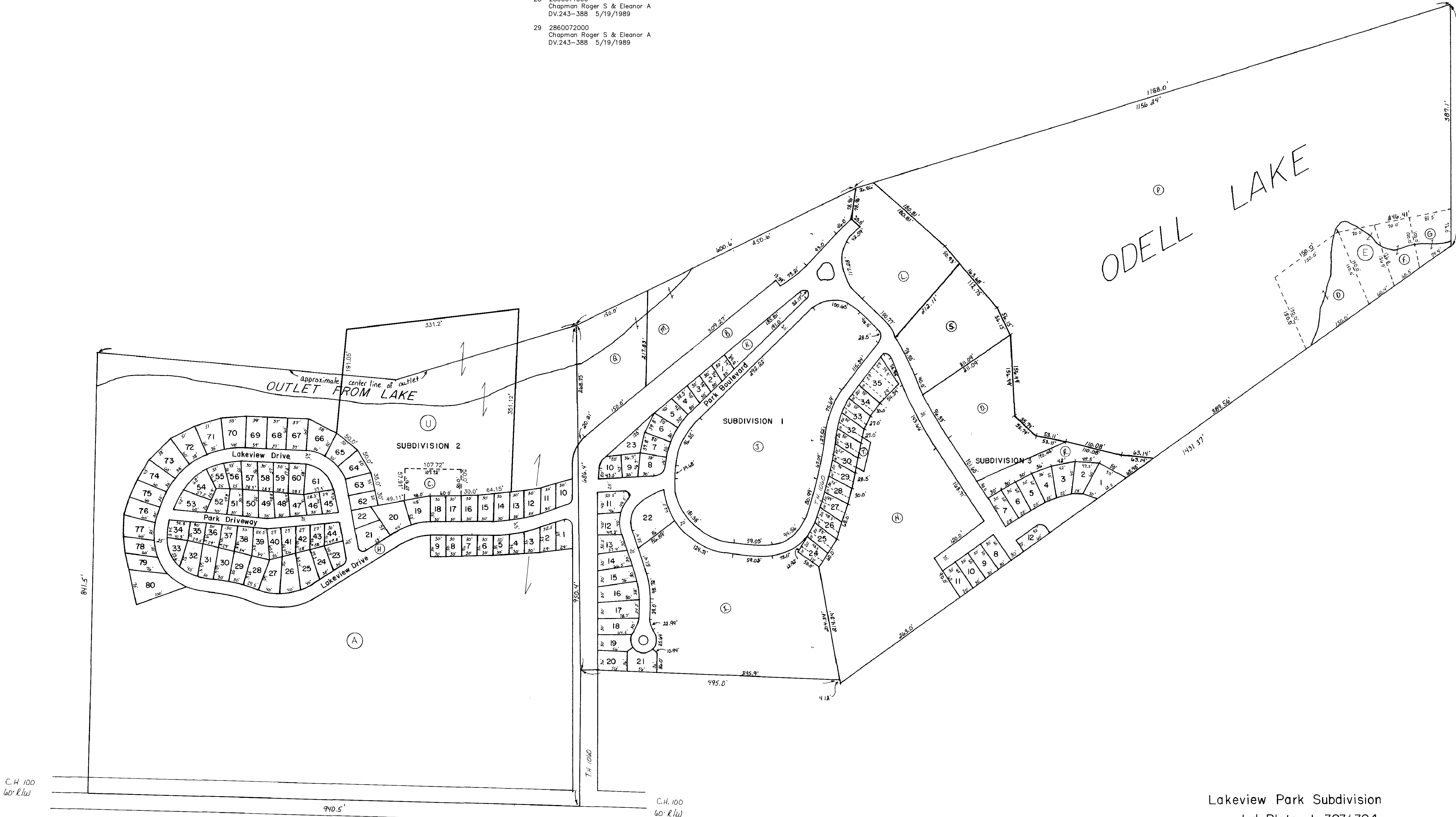
Lakeview Park Subdivision recorded Plats: 1-383' 384 2-3 1-389' 390