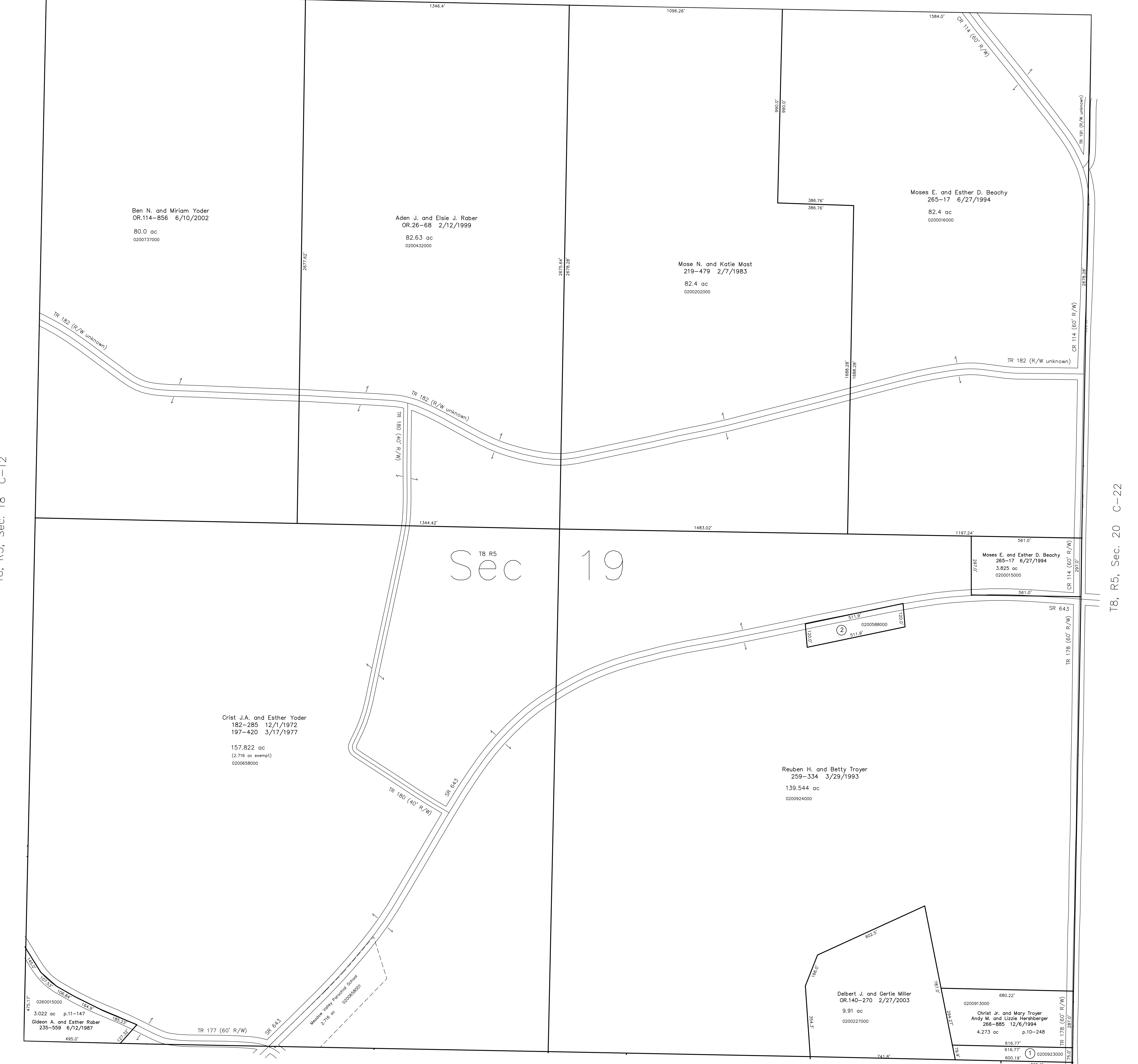
T8, R5, Sec. 12 C-18