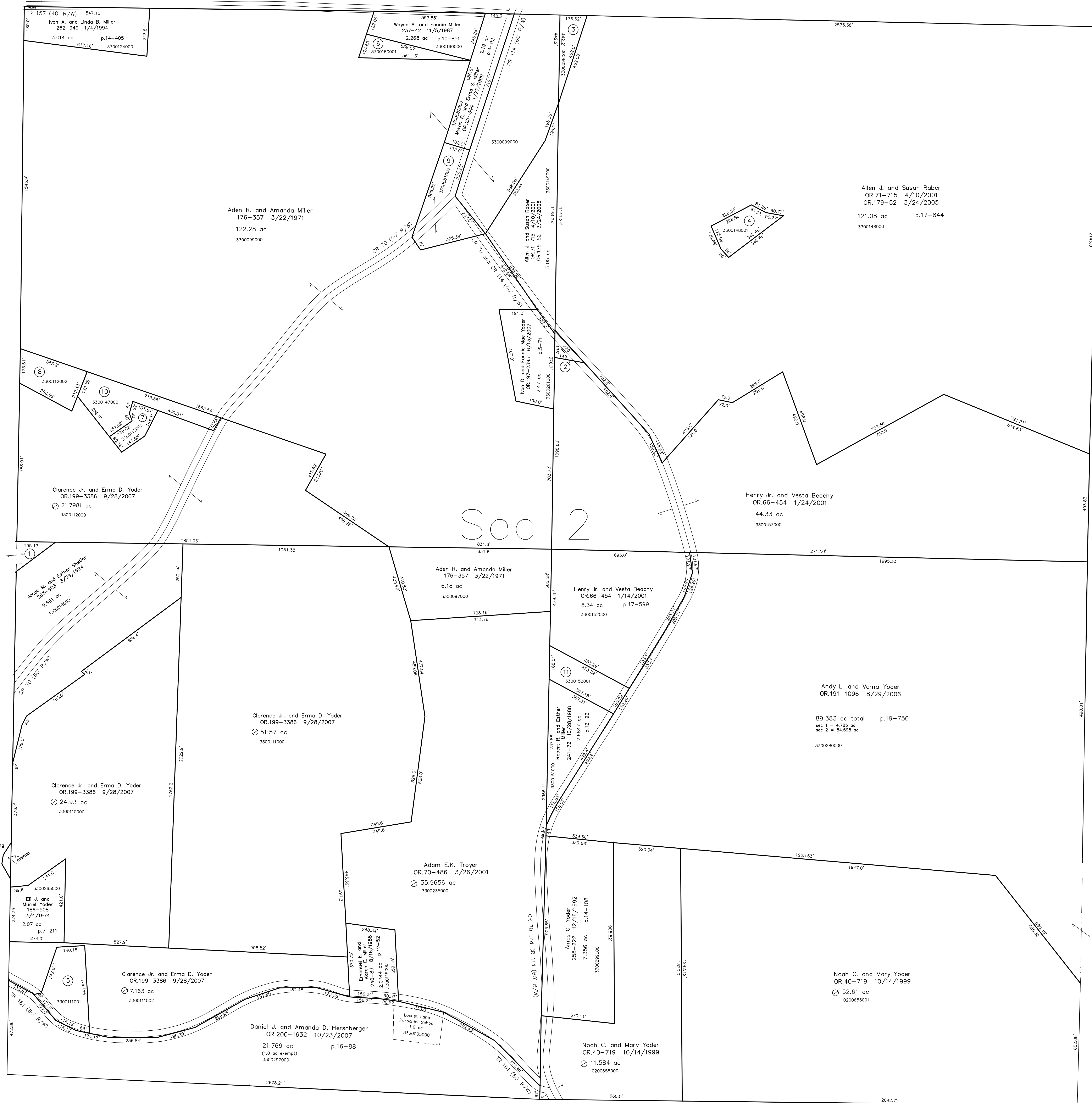
T8, R5, Sec. 9 C-19