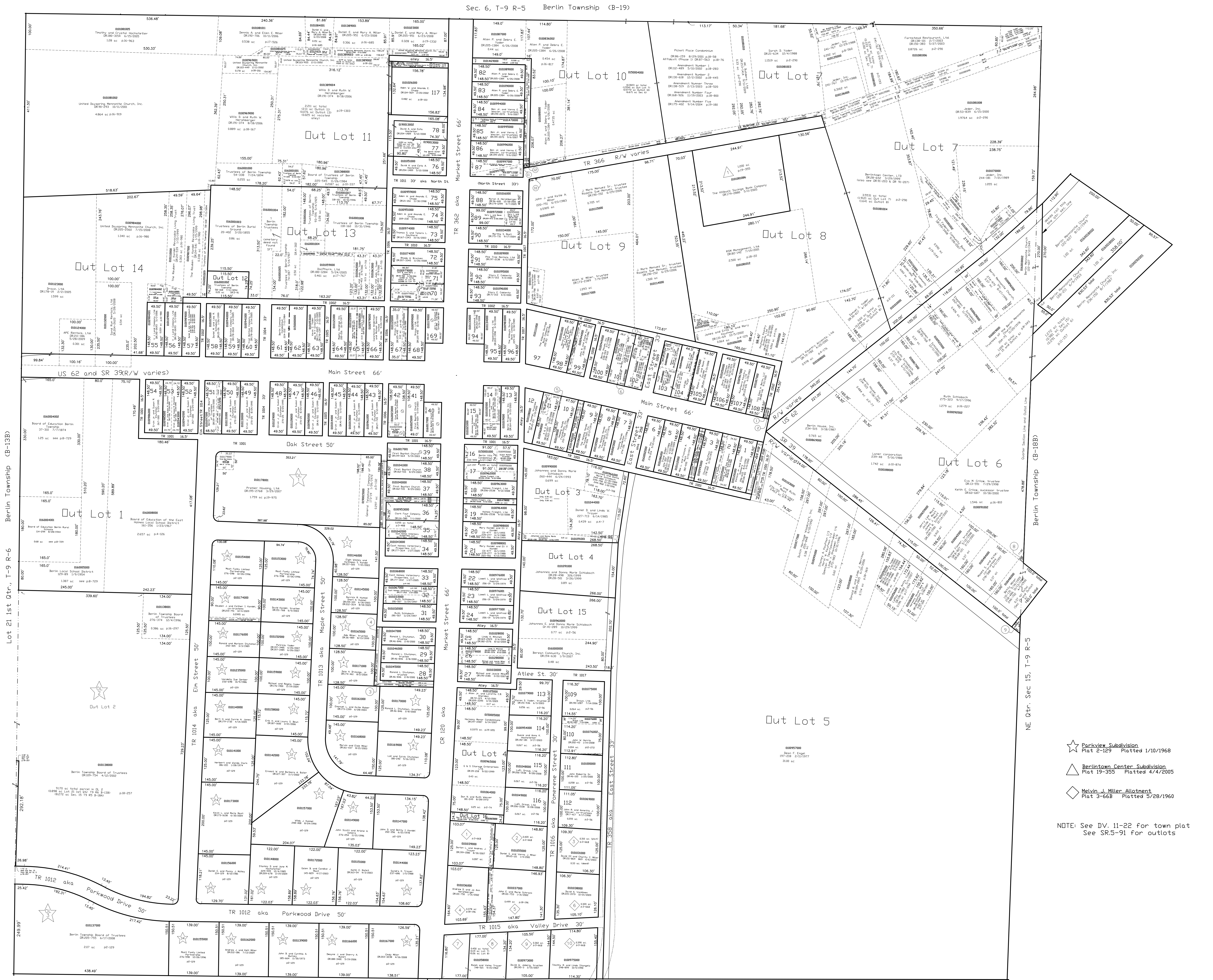
Lot 40 3rd Qtr., T-9 Berlin Township (B-18D) R-5