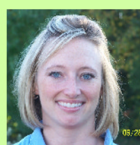
Lacy Iberis Speech & Language