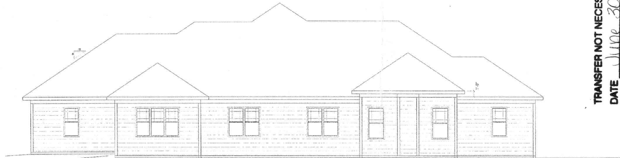
Building #8 Rear Elevation