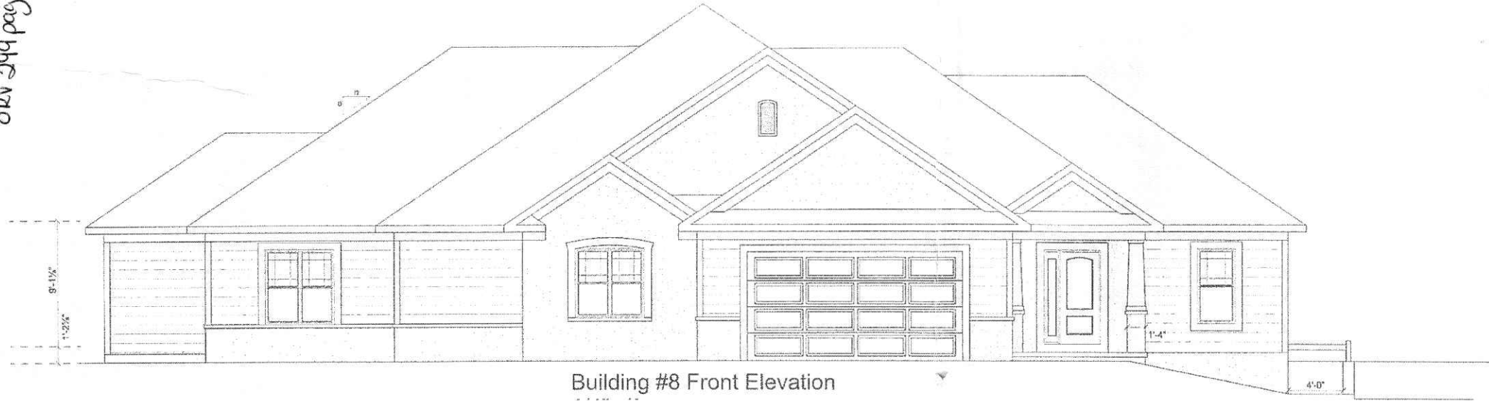
Building #8 Front Elevation