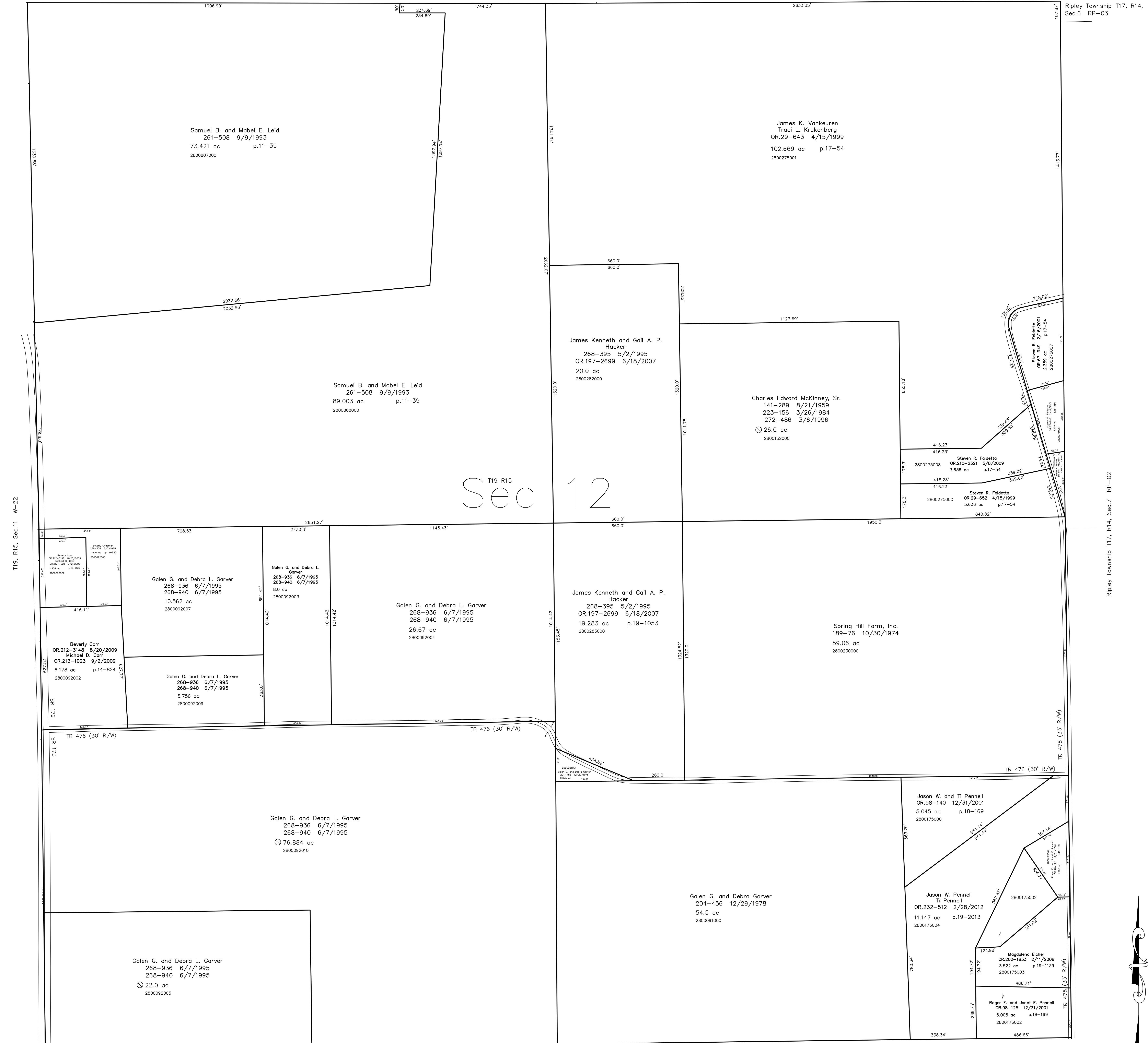
T19, R15, Sec.1 W-28